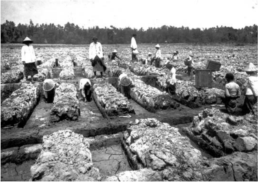
Figure 2. The “industrial plantation” in its internationally most evolved form, in the Dutch East Indies in the 1910s: the supervision of cane planting in ground opened on the modified Reynoso system used throughout Java from the late nineteenth century onward. Note the use of female labour, the industrial regularity of the plantation, and the equally industrial level of supervision of manual labour. Sugar factory Ketanen, 1916.