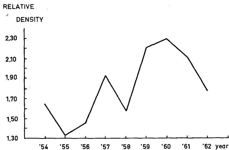
FIGURE 2. Relative density of the Woodpigeon population in the Netherlands, based on Table 2.

In table II the required data are given together with the estimated result, viz. the "number of pigeons shot per man per week". These figures have also been plotted in the form of a curve which is reproduced in Figure 2. The changes in density appear to be of the kind which is to be expected in a normally fluctuating population. In the two years following 1958 an increase in density is noticeable, but in the next years there is once more a decrease. The form of the curve suggests a regularly undulating movement ( cf. DOUDE VAN TROOSTWIJK, in the press).