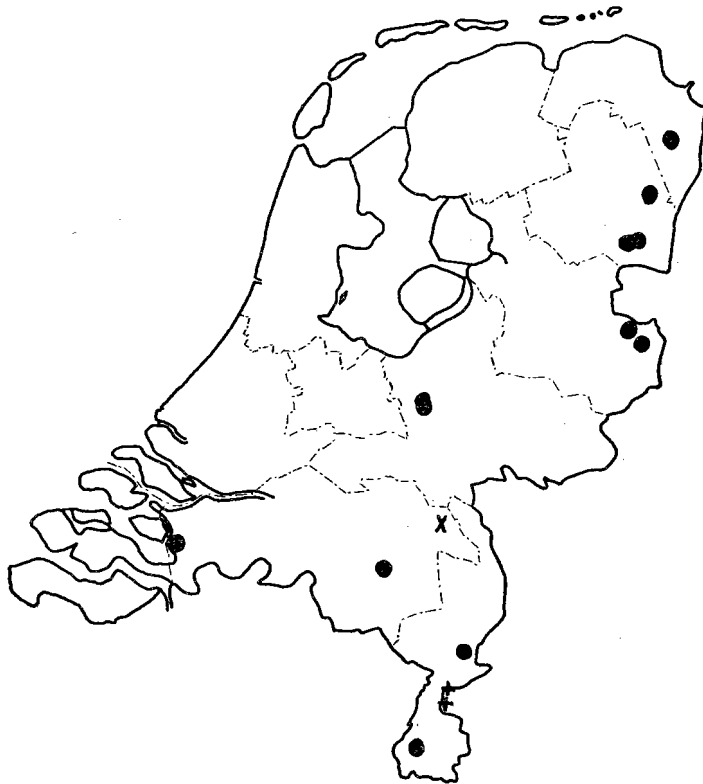
FIGURE 4. Recoveries in the Netherlands of Woodpigeons ringed abroad. ● Recoveries from Germany + Recoveries from Sweden × Recovery from Denmark

It must therefore be regarded as improbable that Scandinavian Woodpigeons would spend the winter in the Netherlands or that they would establish themselves here. Moreover, as the population density of the Woodpigeon in Scandinavia is but small (MURTON 1961), the effect which such occasional settlements would exercise on the density of the population in the Netherlands would be negligible. However, an immigration from Germany cannot be entirely excluded, although this too would be one on a small scale only.