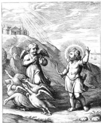
Figure 3 : Gravata respuit, p. 53

The second aspect of metaphor in Amoris Divini Emblemata that I want to discuss is the question of its relation to allegory. What I will try to show is how deeply the allegorical and the metaphorical are intertwined in this book. As we did for the metaphor, we should realize