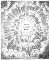
Figure 4 : Deus ante omnia amandus, p. 9

To conclude, I want to return to the issue of the relationship between Amor Divinus and Anima, which I will approach by discussing the only picture from which they are absent, the pictura of the first emblem in the book, DEUS ANTE OMNIA AMANDUS (fig. 4). 23 We see a glory of clouds, with the words ‘Oculus non vidit, nec auris audivit.’ 24 This bible quotation is taken up in the epigrams to convince the reader that he should love God, and that God will give something in return that the eye has not seen and the ear has not heard.