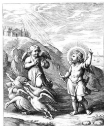
Figure 3 : Gravata respuit, p. 53

The second aspect of metaphor in Amoris Divini Emblemata that I want to discuss is the question of its relation to allegory. What I will try to show is how deeply the allegorical and the metaphorical are intertwined in this book. As we did for the metaphor, we should realize