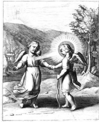
Figure 1 : Mentis sol amor dei , p. 19

Many of the metaphors that create the intellectual coherence of the book are clearly present in MENTIS SOL AMOR DEI (fig.1). First of all there is the light. The fullest statement of the metaphor structuring the emblem is given in the first quote, from Augustine : ‘What the sun is to the senses, love is to the mind, and as the sun illuminates earthly things so that they may be seen, so God’s love illuminates spiritual things’. The pictura shows the sun, and a beam of light emanating from Divine Love’s nimbus and shining on the soul’s heart. Metaphors of light are ubiquitous in Amoris Divini Emblemata . The Dutch and French epigrams mention the fruits born by nature under the influence of sunlight and compare these to the fruits of Divine Love. Imagery of fruits, of plant life, of trees, and therefore of agriculture, recurs throughout the book. Mario Praz severely criticised Vaenius for the bleakness and barrenness of his landscapes in Amoris Divini Emblemata , but in fact most pictures show vegetation – as this one amply does. 6 And in the context of this book, each tree and each plant is proof of God’s presence in the world.