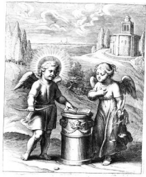
Figure 5 : Virtus character amoris, p. 35

A very interesting emblem in this context is VIRTUS CHARACTER AMORIS , 27 as it shows the whole process (fig. 5) : Divine Love points out a passage in a book, the soul takes that to heart, and as a result, she is '[D]e bonnes œuvres reuestuz', as the French epigram says, clothed in the virtues (bridle, scales, mirror) that the inscription states are the proof of Love. Now the book, presumably, is primarily the Bible, but I think we are justified in also thinking of the emblem book, which would equate Divine Love with the emblem's author, Anima with the emblem's reader.