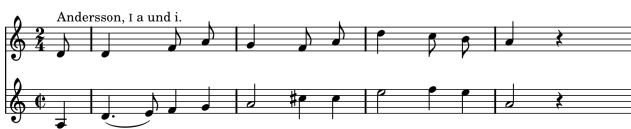
Figure 2: Example of an alignment of two folk song melodies by Wiora (1941).

An important device for folk song researchers to examine the similarity of two melodies is the construction of an alignment. By notating the melodies below each other such that the corresponding parts are aligned, the differences and similarities between the melodies are easier to inspect visually. As an example, Figure 2 shows an alignment that was constructed by Walter Wiora (1941). As all the alignments in his article, which are many, it was ‘hand-crafted’. The availability of a method to automatically find an adequate alignment of two melodies would enable the employment of this device on a large scale.