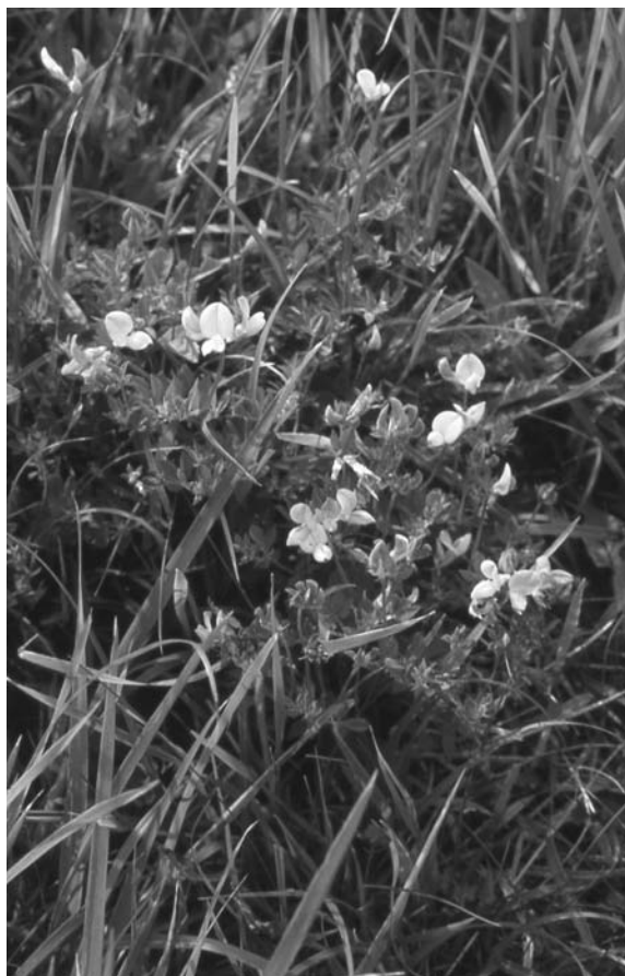
PLATE 1. Lotus corniculatus .

Climate and soil had interactive effects on most performance traits of both species, indicating that the influence of climate depended on soil type and vice versa. Populations of H. lanatus differed in their response to climate but, importantly, there were no