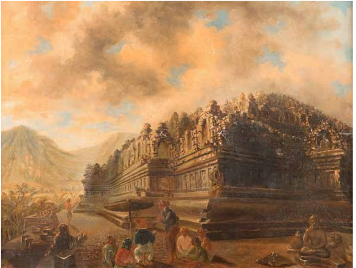
▲ H.N. Sieburgh, The north-east corner of the basement of the Borobudur, including a depiction of painter in action on location, 1837. National Museum of Ethnology, Leiden, 37-643.