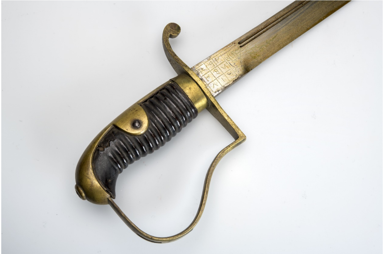
Photo: Collection Nationaal Museum van Wereldculturen. Coll.no. TM-H-1669

The brass hilt deviates from a regular beladah belabang because the cross guard, knuckle guard and the grip are not decorated. Moreover, other than with a regular beladah belabang the knuckle guard is not attached to the grip but runs into the pommel, and the tang of the blade is not attached with a characteristic winged nut but is riveted on the top. The grip, ribbed and coated with black leather, probably originates from a western sabre, or is an imitation of it. The sheath is made of wood, and coated with a layer of black leather. 3 The blade is treated with varnish, probably by curators attempting to prevent degradation.