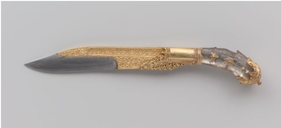
Photo 1: Kandyan knife. (Rijksmuseum, Amsterdam, inv.no. NG-NM-7114).

The pihiya , recorded as NG-NM-7114, has an engraved crystal hilt set with gold. Two-thirds of the blade is covered with elegantly worked gold. The wooden sheath is embossed with a golden plate, the edges are decorated with filigree, ending in a curl in the bottom. 1 The length of the knife is 29,5 cm. The Colombo National Museum has assessed 75 similar types of knives in their museum collection, and shows that NG-NM-7114 stands out by its crystal handle, the usage of gold and its decoration. 2 This is also the case for the four Kandyan knives that are at present in the collection of the Royal Asian Art Society in The Netherlands (on loan in the Rijksmuseum), as well as in the collection of the Dutch National Museum of World Cultures: these are all of a coarser type than NG-NM-7114, both with regard to the craftsmanship and material used. 3