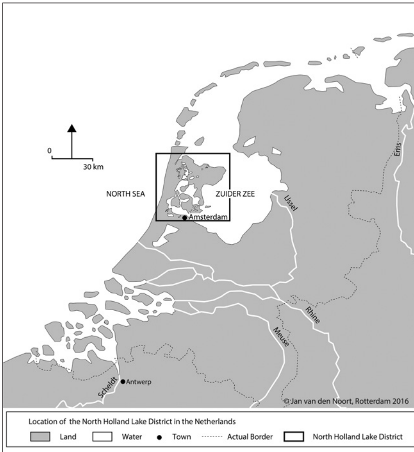
Map 1. Location of the North Holland Lake District in the Netherlands

by means of dikes. As every island and region had its own ring-dike, there were relatively long stretches of dike to maintain. The key problem in the region was shore erosion along the lakes, which meant that the dikes often had to be heightened and strengthened. Due to avulsion, dikes that had previously had foreshores came to lie directly at the water's edge, meaning that they were exposed to more wash. Dikes would frequently be shifted back, but this resulted in agricultural land being lost. Moreover, this was only a temporary solution, because the fragile peat-land soon became subject to even more avulsion. The large lakes gradually became larger. During the investigation of