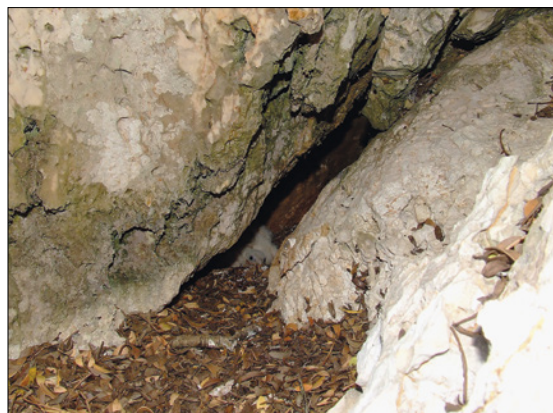
Figure 3: Nest entrance (marked, above; photo: K. Mikulić) and nest with ca. 10 day-old chicks (below; photo: I. Budinski) of Lesser Kestrel Falco naumanni in the colony on Dolin islet

Slika 3: Vhod v gnezdo (označen, zgoraj; foto: K. Mikulić) in gnezdo s približno 10 dni starimi mladiči (spodaj; foto: I. Budinski) južne postovke Falco naumanni v koloniji na otočku Dolin