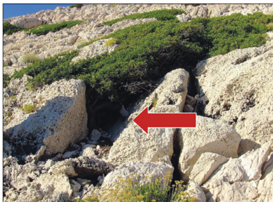
Figure 2: Lesser Kestrel Falco naumanni nest-site in the colony on Dolin islet (position of nest entrance marked)

Slika 2: Gnezdeća kolonija južne postovke Falco naumanni na otočku Dolin (z označenim vhomom v eno izmed gnezd)